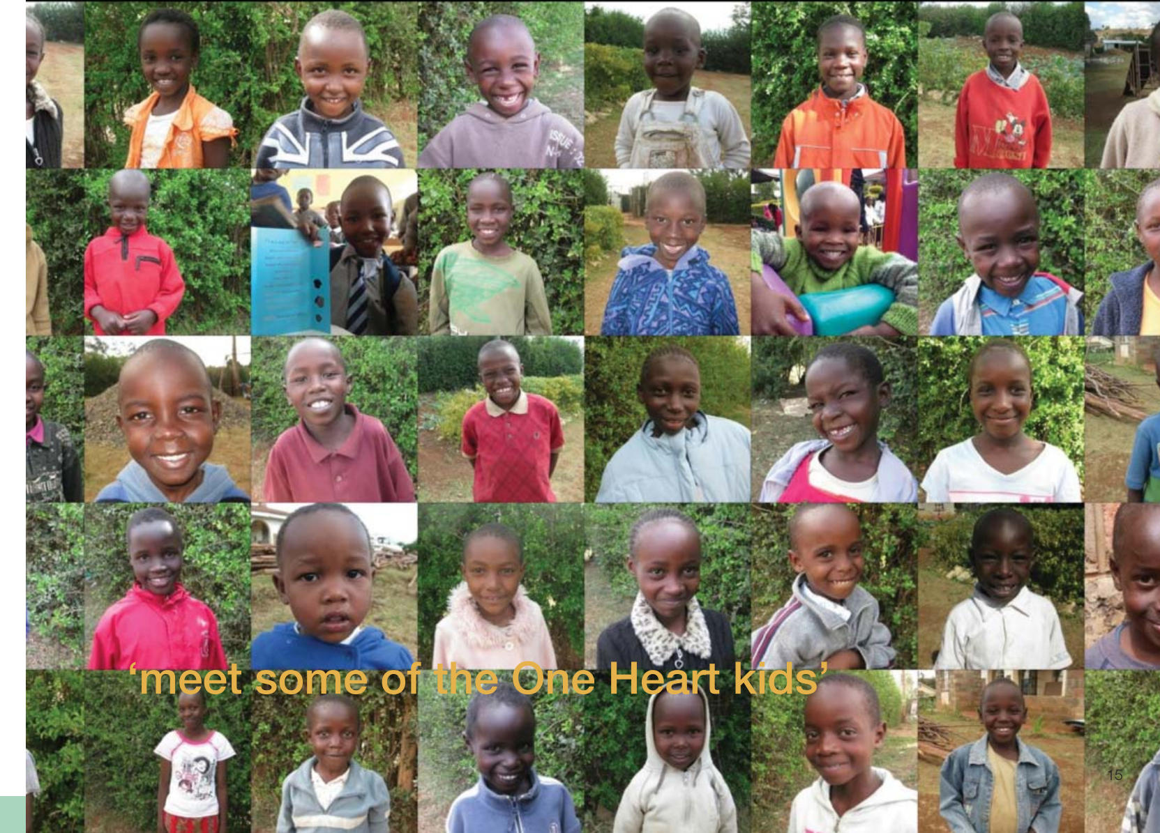
'meet some of the One Heart kids'